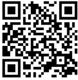
Oteogo Songs Playlist!

Listen to Oteogo music while playing! Scan: